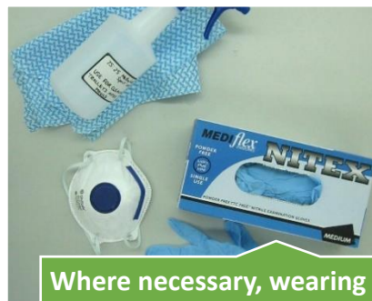
Where necessary, wearing appropriate personal protective equipment (PPE)