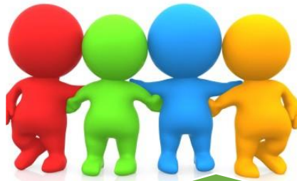
Year group bubbles