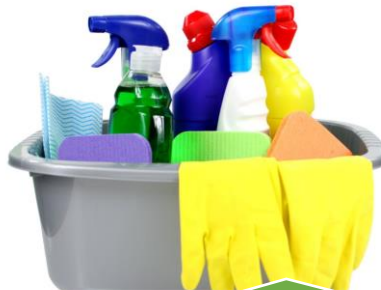
Enhanced cleaning arrangements