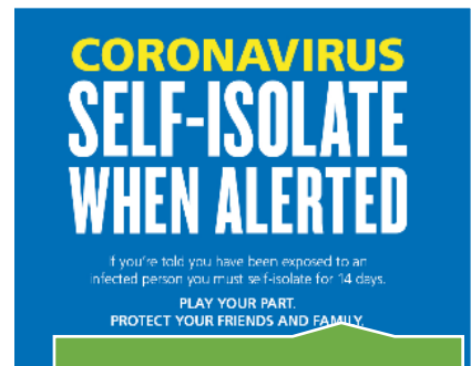
Active engagement with NHS Test and Trace