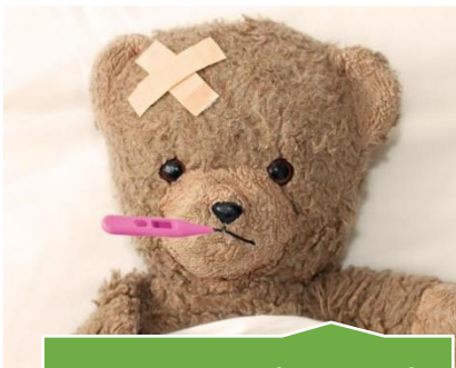
Requirement that people who are ill stay at home